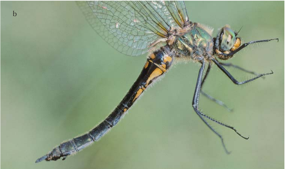
Colour plate I: Somatochlora borisi — (a) premature female from the Diavolorema River near Mikron Dherion, NE Greece, 6 May 2004; (b) mature female from the same locality, 1 June 2003. The abdominal pattern with extensive yellow is typical of this species.