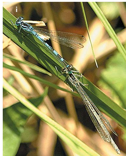
Colour plate IV: Color variation of Enallagma civile and examples of heterospecific pairing — (a) male; (b) andromorphic female; (c) heteromorphic female; (d) intermediate type female; (e) the other study species in comparison: andromorph female of E. aspersum , a monomorphic species; (f) intrageneric mistake: male of E. carunculatum in tandem with female of E. basidens ; (g) another intrageneric mistake: male of Platycnemis pennipes accompanying an ovipositing female of P. acutipennis ; (h) intergeneric mistake: male of Ischnura elegans in tandem with female of Erythromma lindenii ; (i) mistake between different families: male of Coenagrion ornatum in tandem with female of Platycnemis pennipes .