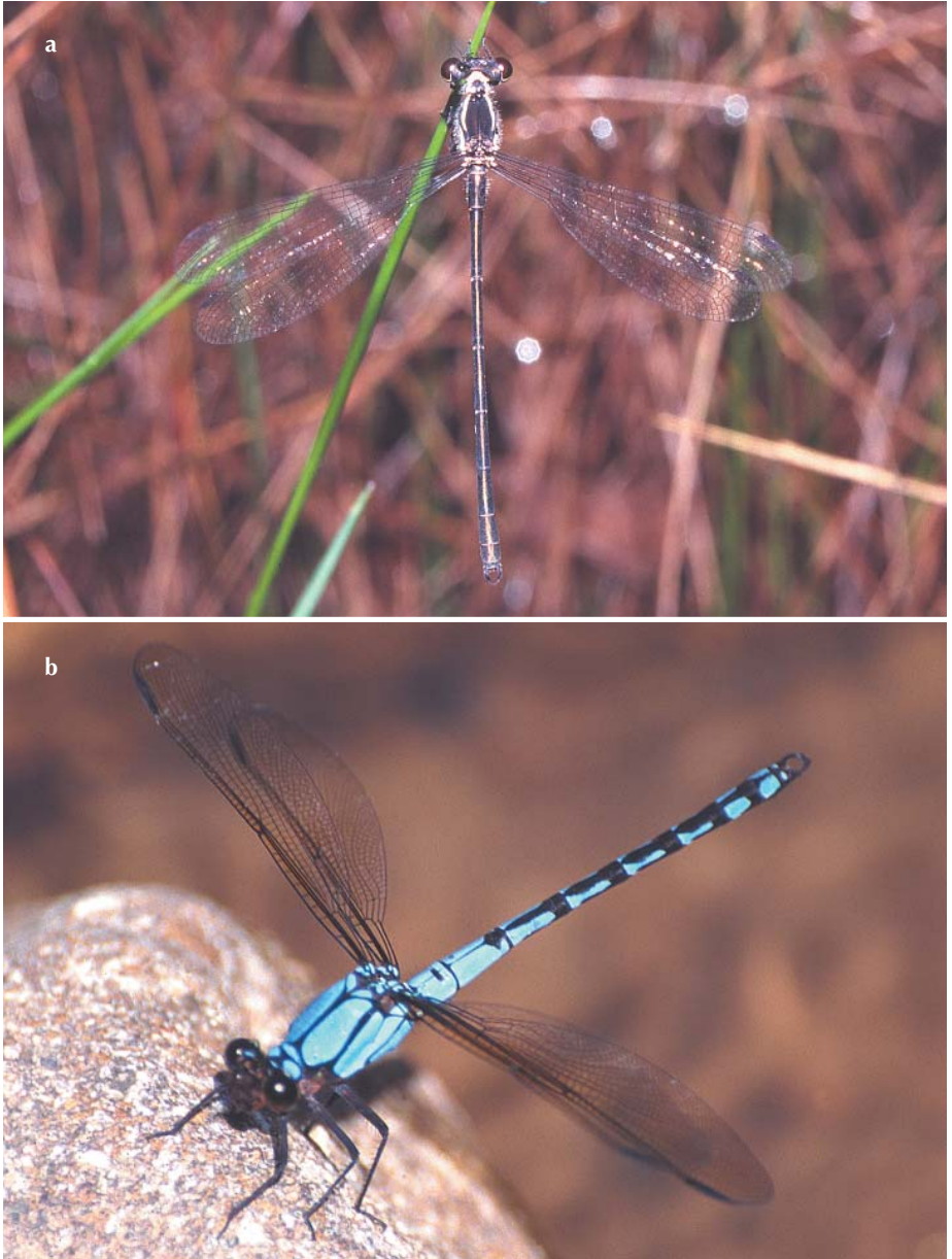
Colour plate III: Two typical zygopteran openwing perchers — (a) Griseargiolestes griseus (Megapodagrionidae), Govett's Leap, Blue Mountains National Park, New South Wales, Australia, 11 December 1998; (b) Diphlebia nymphoides (Diphlebiidae), Megalong Creek at Old Ford Reserve, New South Wales, Australia, 11 December 1998. See also cover photo.