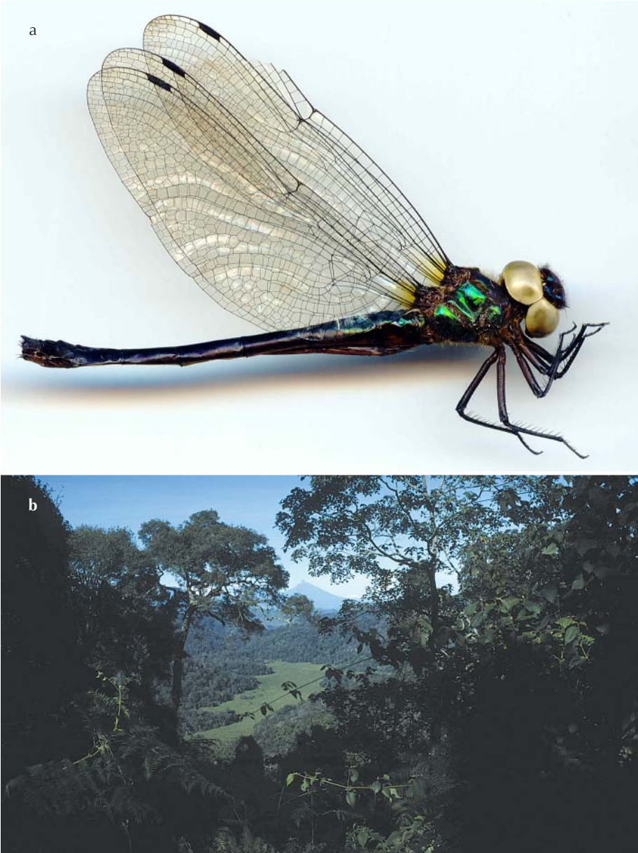
Colour plate II: Idomacromia jilliana sp. nov. — (a) holotype female; (b) type locality at Ruhija in Uganda, Kabale District, Bwindi Impenetrable National Park (alt. 2,100 m) – view of Mubwindi Swamp and the Virunga Volcanoes, with the collecting site in the forest to the right of the swamp.