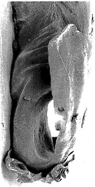
Figure 2. Genital ligula of Pseudagrion camerunense from Cameroon, originally identified as P. angelicum , leg. G.S. Vick.

P. camerunense is known from The Gambia, Sierra Leone, Liberia, Côte d'Ivoire, Ghana, Nigeria, Cameroon and Bioko (Fraser 1947; Pinhey 1971; Gambles 1980; Lempert 1988; Carf & D'Andrea 1994; Gambles et al. 1998; Vick 1999). Obviously, the species should be removed from the list of threatened African Odonata (Pinhey 1982). Indeed it is found in open, often disturbed, habitats (Lempert 1988, own observations).