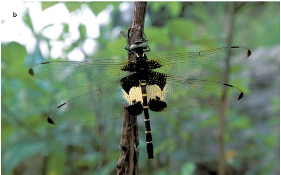
Colour plate II: v. — (a) Planaeschna suichangensis , male; (b) Chlorogomphus papilio , type locality at Ruhija in Uganda, Kabale District, Bwindi Impenetrable National Park (alt. 2,100 m) – view of Mubwindi Swamp and the Virunga Volcanoes, with the collecting site in the forest to the right of the swamp.