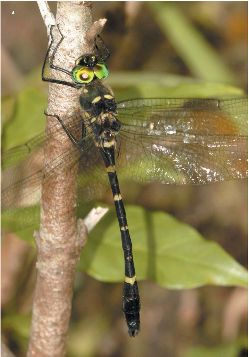
Colour plate IV: Macromia clio , male